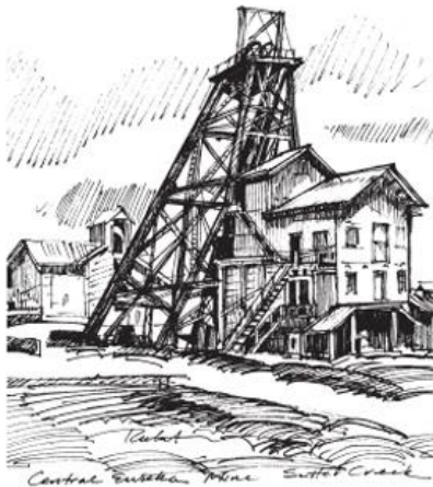
Central Eureka Mine Sutter Creek